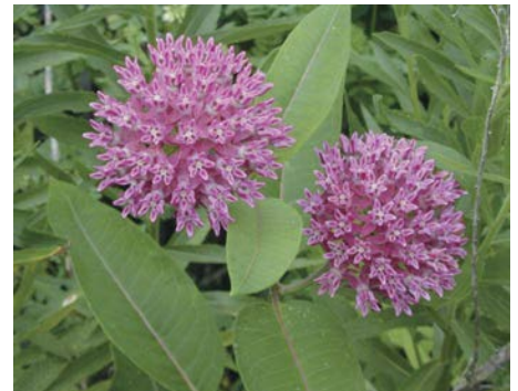
A. purpurescens L. Purple milkweed Southeastern Canada, and Midwest and northeastern US Chip Taylor