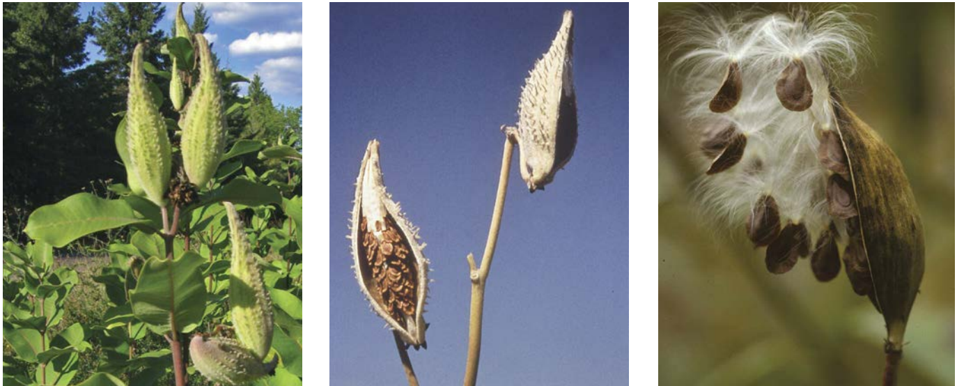
Figure 6. Maturing fruits (follicles) of common milkweed (left); mature follicles of showy milkweed with a portion of one fruit removed to show seeds (center); and seeds emerging from swamp milkweed (right).

During pollination, pollinia attach to hairs on the feet or heads of insect pollinators and are then carried to other individual milkweeds. Most milkweed species are self-incompatible, meaning that for the development of viable seeds, individuals must receive pollen from other individuals of the same species (Kephart 1981; Bookman 1983; Kahn and Morse 1991; Browles and Wyatt 1999; Ivey and others 1999). Flowers develop into dehiscent fruits, known as follicles, which mature in late summer through fall. Follicles split open on one side to release ripe seeds that are flattened, brown, and attached to long, silky, white hairs that facilitate wind dispersal of upland species and water dispersal of swamp milkweed ( A. incarnata L.) (Wilbur 1976; Pavek 1992; Kantrud 1995).