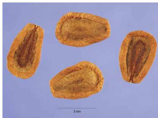
Figure 7. Seeds of butterfly (left) and common milkweed (right). Note the edge of the penny in the left photo and the 5-mm line in the right photo.