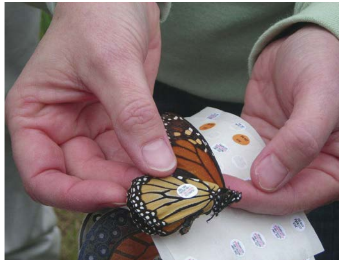
Figure 4. A tagged monarch on the Wayne National Forest in southeastern Ohio.

8 One partner is the USDA Forest Service, which has initiated