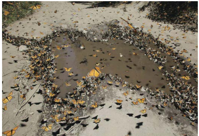
Figure 8. Monarchs visiting a mud hole on their wintering grounds in central Mexico.

Butterfly milkweed has been propagated from 8 to 10-cm (3 to 4-in) stem cuttings taken from the terminal shoot before the plant begins to flower (Phillips 1985; Grabowski 1996). Keep