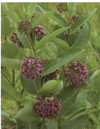
A. syriaca L. Common milkweed Throughout North America east of the Rocky Mountains