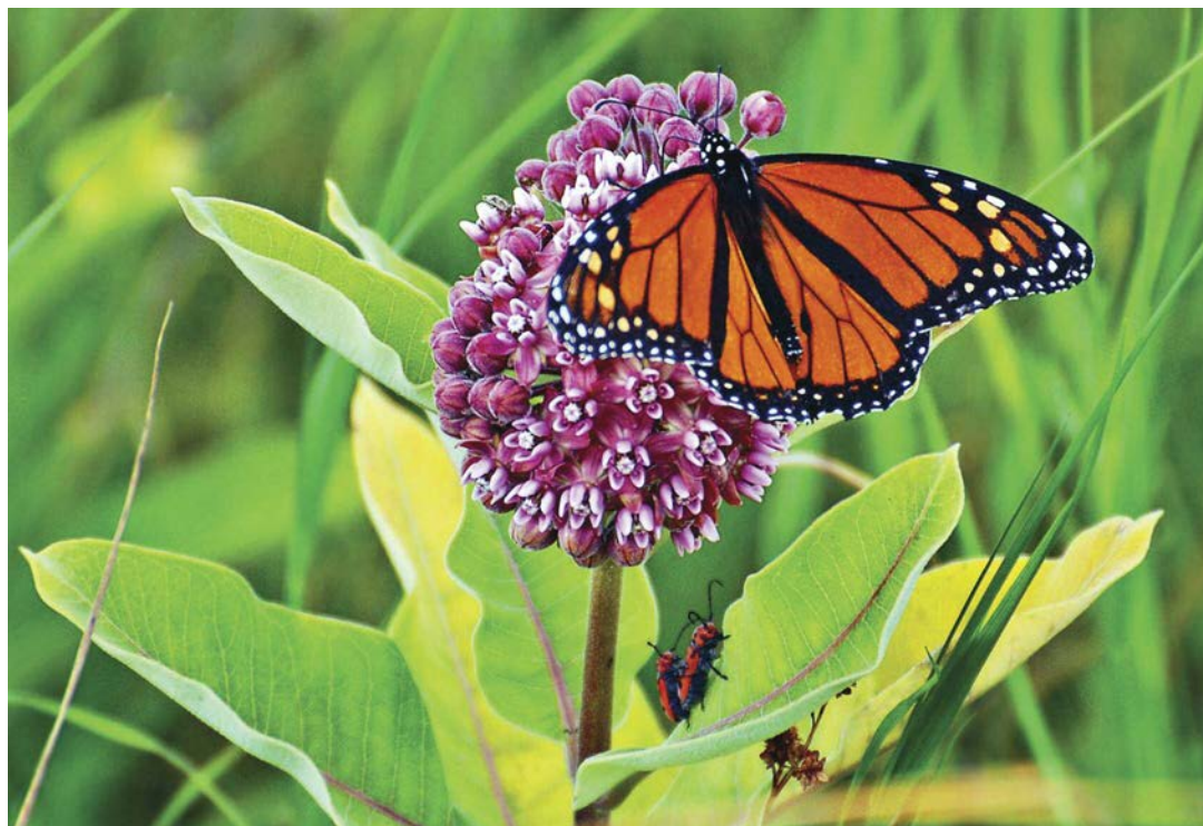
A male monarch feeding on common milkweed.