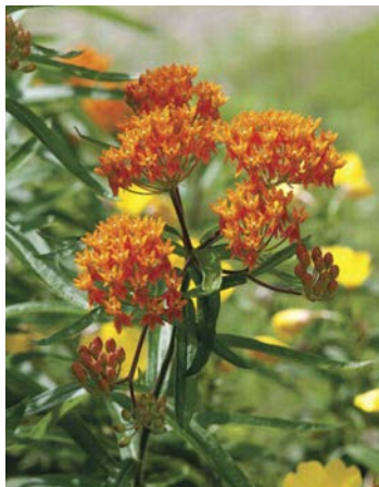
A. tuberosa L. Butterfly milkweed Southeastern Canada, Midwest, and northeastern US to Utah and Arizona, and northern Mexico