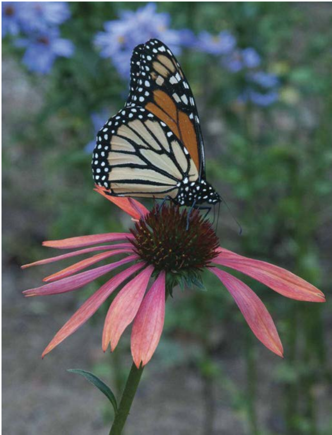
Figure 3. Species that bloom late in the summer and in early fall, such as this Echinacea species, are important food sources for migrating monarchs.

Mexico, they were exposed to record amounts of precipitation as well as a major storm with heavy precipitation and high winds that was followed by cold temperatures ( -6^{\circ}\text{C} [ 21^{\circ}\text{F} ]). They conclude this storm was responsible for killing 50% of the overwintering monarchs. The vulnerability of overwintering monarchs to weather extremes is worrisome considering the variable weather predicted with climate change (Oberhauser and Peterson 2003).