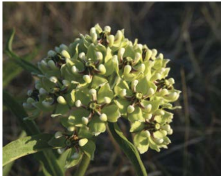
A. asperula Dcne. Antelope horns Southwestern US, northern Mexico