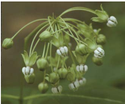
A. exaltata Poke milkweed Ontario, Minnesota, and northeastern US south to Georgia