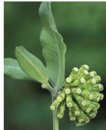
A. viridiflora Raf. Green comet milkweed Southern Canada and the US east of the Rocky Mountains