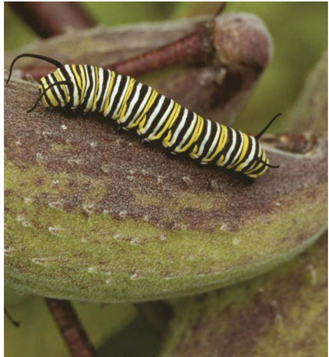
Figure 5. Monarch caterpillars are vividly striped to warn potential predators that they taste poorly and are toxic, a result of their diet on milkweeds.