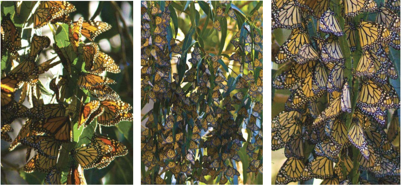
Figure 2. Clusters of monarchs on eucalyptus trees at Natural Bridges State Beach in Santa Cruz, California.

they described 3 factors that appear to have contributed to this decline: 1) degradation of the forest in the overwintering areas; 2) the loss of breeding habitat in the US due to the expanded use of herbicide-resistant crops and conversion of agricultural lands; and 3) extreme weather.